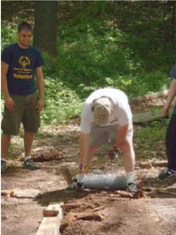
Former Eagle Scout supervising