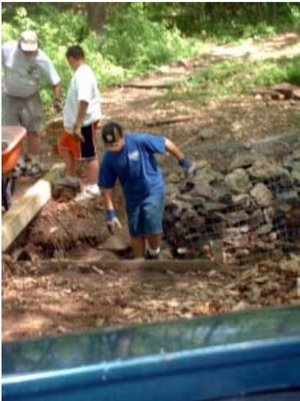
Climbing out of the stream