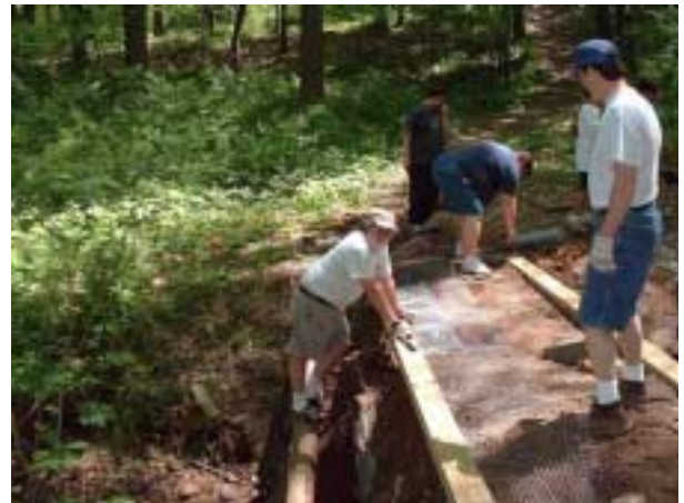
Warthog patrol working on bridge repair