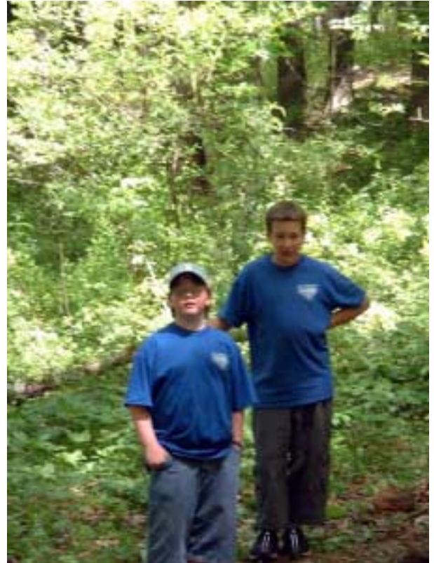
2 fine scouts taking a well-deserved break