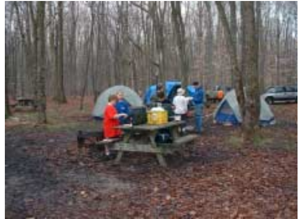
Getting ready for breakfast