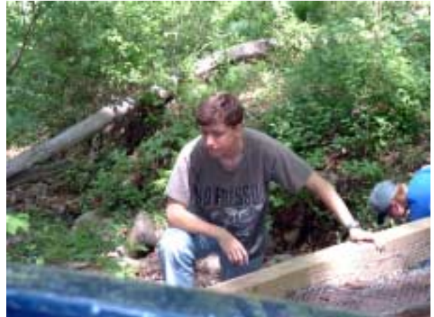
SPL looking over the work