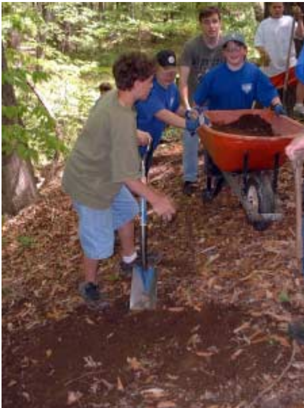
Still digging for dirt