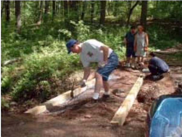
Preparing for concrete