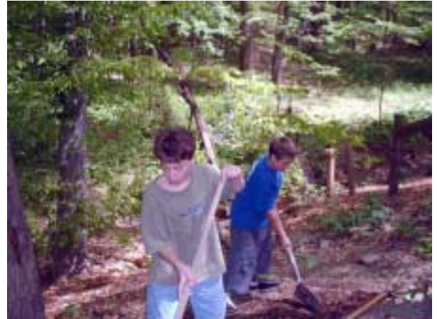
Filing in the bridge