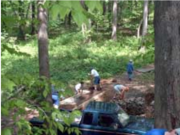
Another view of the bridge repair work