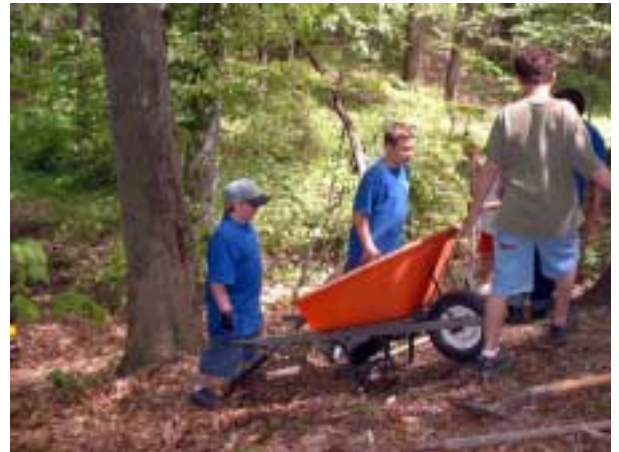
Looking for more dirt