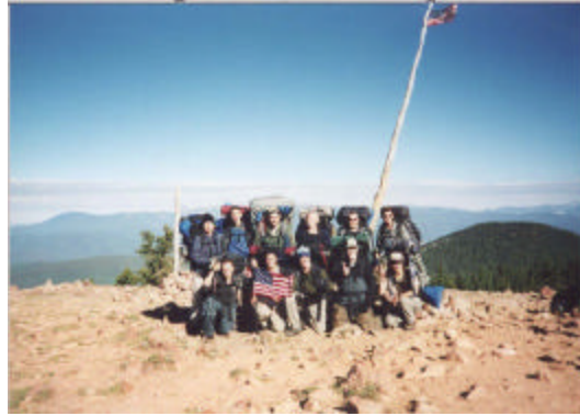
On the summit of Philips at 11,711 ft above sea level July 2001